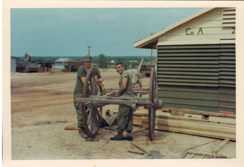
0009 .jpg (2982x2051)