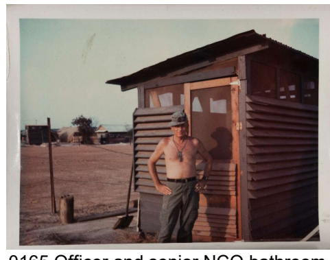
0165 Officer and senior NCO bathroom, Dau Tieng.jpg (4248x3168)