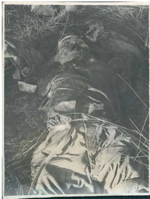
0139 VC Sgt.jpg (2020x2661)