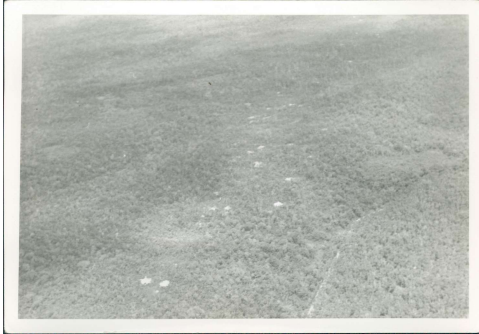
0091 Shell craters.jpg (2988x2082)