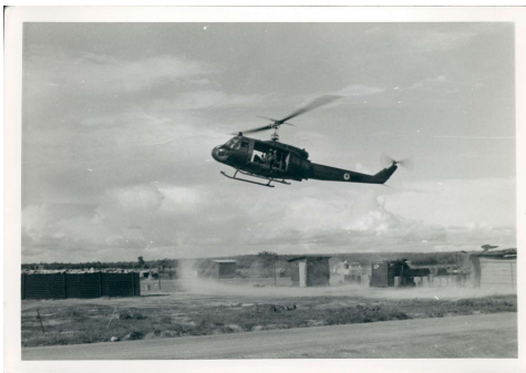
0069 Gun ship.jpg (2994x2080)