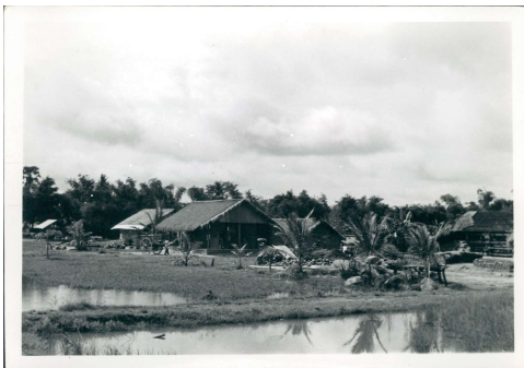
0067 Small village we destroyed.jpg (2986x2080)