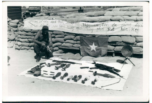
0121 Enemy weapons captured Dec 67 for trophy room.jpg (3020x2099)