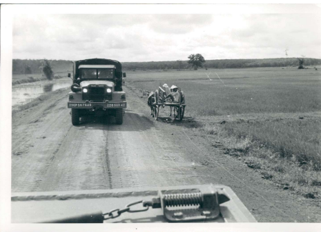
0055 Rice field near Dau Tieng.jpg (2984x2079)