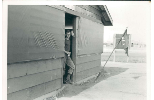
0131 Farout of orderly room.jpg (2988x2088)