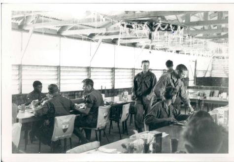
0077 Christmas Day 1967, Base camp.jpg (3036x2047)