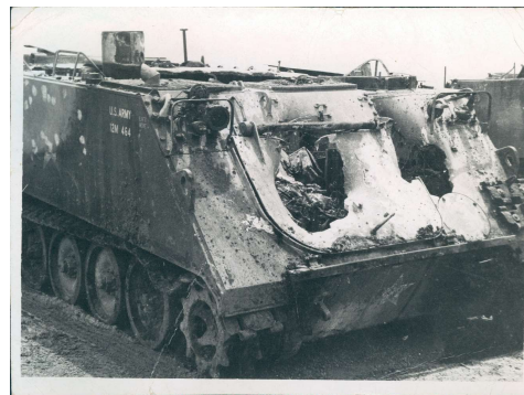
0079 17 th oct 67 0930. 2 rpg-7 rounds. We lost 4 men.jpg (2678x1986)