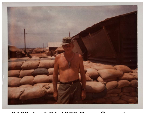
0163 April 21 1968 Base Camp.jpg (4241x3188)