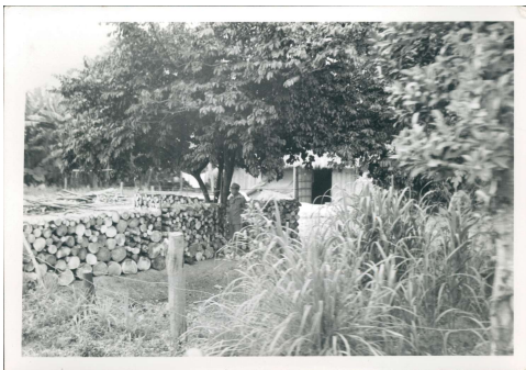
0051 Village.jpg (2998x2078)