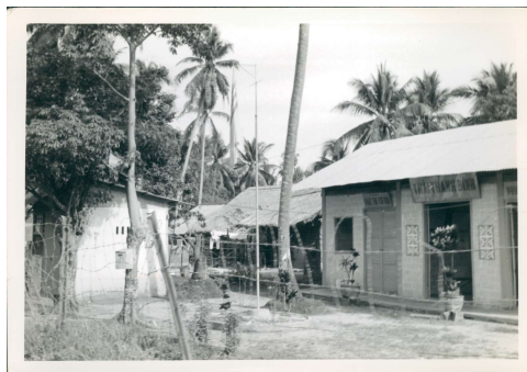
0045 Village in the jungle.jpg (2982x2085)