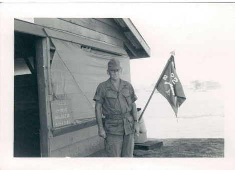
0039 Orderly room Dec 67.jpg (2732x1913)