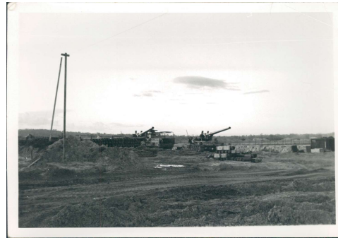
0087 175 mm gun, air support at Dau Tiang.jpg (2992x2083)