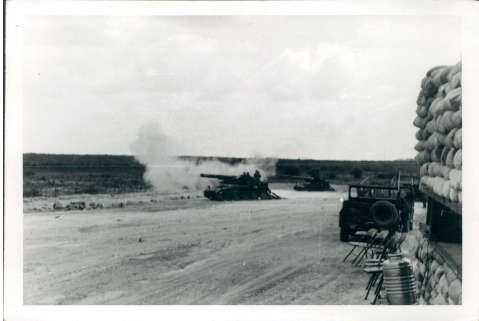
0123 8 inch gun firing direct fire from Dau Tieng.jpg (3042x2051)