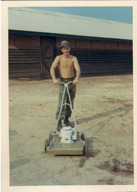
0011 .jpg (2092x2904)