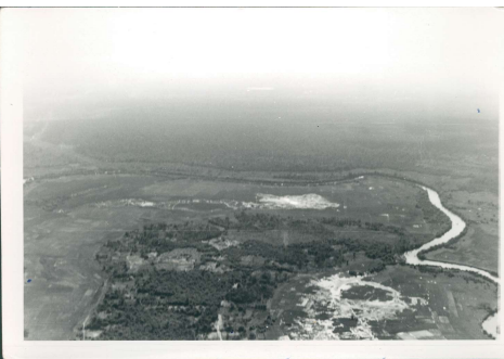
0063 Saigon River.jpg (3026x2050)