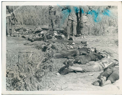
0147 2 Jan 1968.jpg (2682x2040)