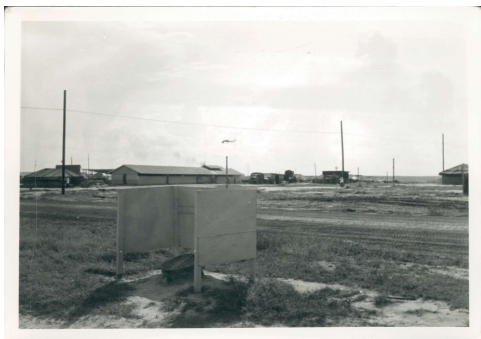
0043 Dau Tieng air Conditioner.jpg (2982x2083)