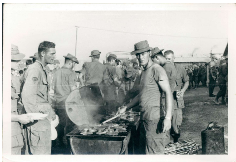
0075 Steak Dec 22nd 1967.jpg (3026x2053)