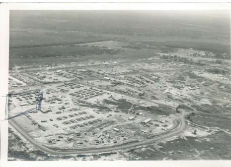
0071 Dau Tieng base camp from 1200 ft. Jungle on one side and rubber plantation on other side.jpg (2990x2080)