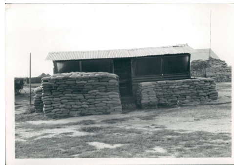
0047 My house, base camp Dec 67.jpg (3000x2089)