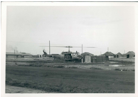
0053 Gun Ship.jpg (3000x2085)