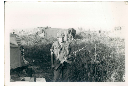
0041 Near Cambodian border Dec 1967. jpg (3032x2047)