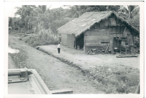
0089 Village.jpg (2980x2090)