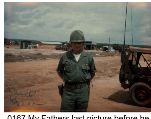
0167 My Fathers last picture before he was KIA May 31 1968.jpg (3814x2803)