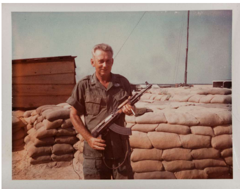
0161 Russian AK47 captured 13 April 1968.jpg (4176x3240)