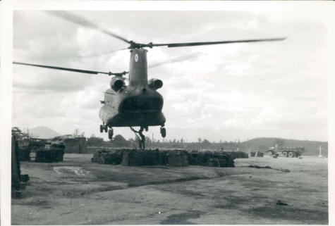
0127 Resupply by Air.jpg (2986x2078)