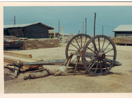
0005 .jpg (2988x2057)