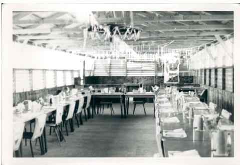
0059 Mess hall Dau Tieng X mas day 1967. Main dinner was in field. Very few there.jpg (3016x2056)