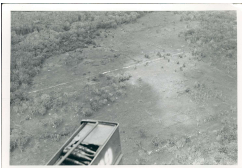
0061 Recon.jpg (2988x2078)