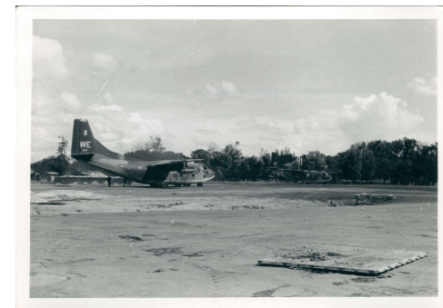
0049 C 123 for troop movement.jpg (2990x2085)