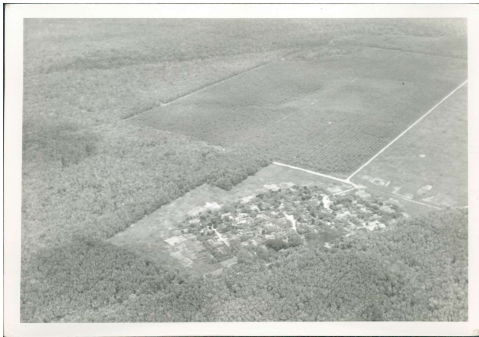
0083 Small village in rubber plantation. jpg (2998x2083)