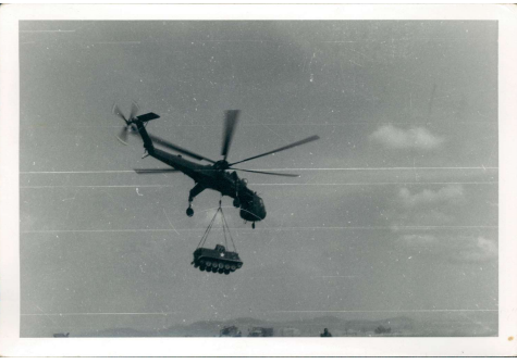
0119 Air lift pc to fire support base Burt, 1 jan 68.jpg (3028x2053)