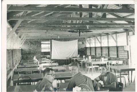
0125 Mess hall.jpg (2988x2077)