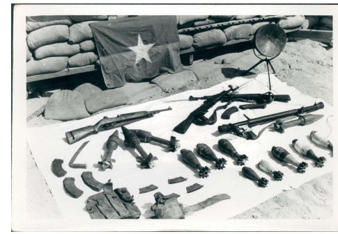
0057 Enemy Weapons.jpg (3030x2065)