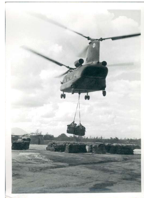
0065 Resupply Chinook.jpg (2126x2935)