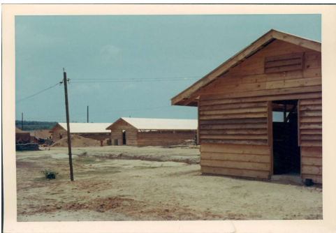
0007 .jpg (3010x2054)