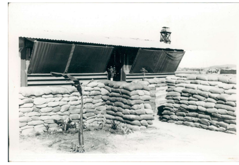
0073 Dau Tieng base camp house. Built bunker on other side. Took some rounds.jpg (3014x2042)