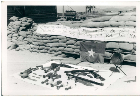
0085 Enemy Weapons.jpg (3028x2059)